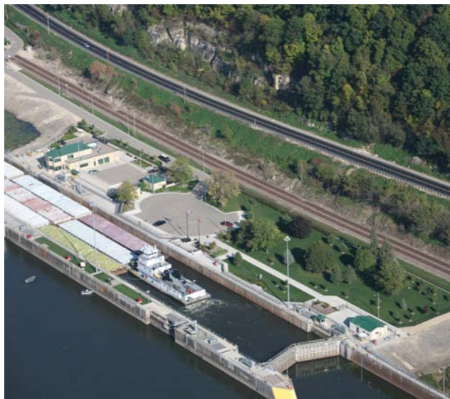
Aerial Photograph of Lock & Dam 9.

See panel to the right for registration address And contact information.