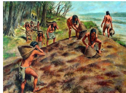
Mound Building by George Armstrong