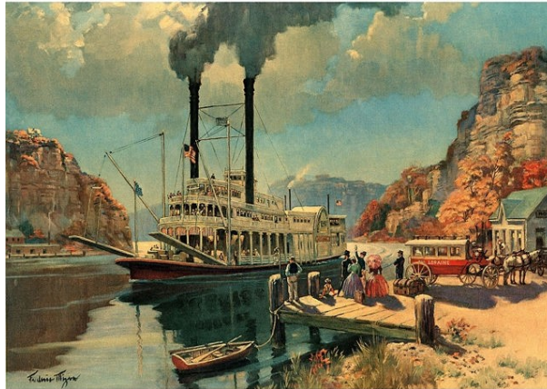
Lynxville Landing by Frederic Mizen