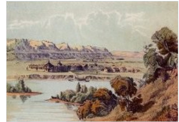
The First Fort Crawford by Henry Lewis