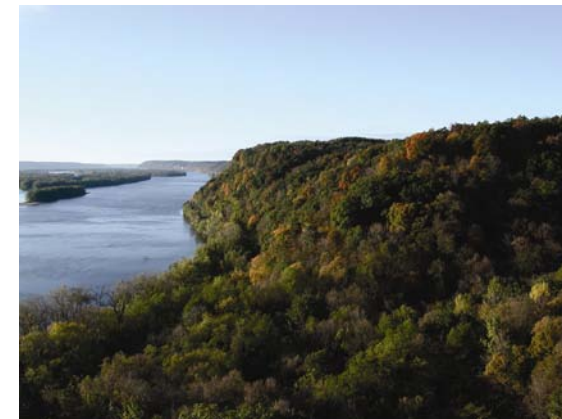
View from Fire Point, Effigy Mounds National Monument