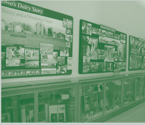
Artifacts show changes in the dairy industry.

The Dairy Center was the first in a succession of projects and facilities created by the partnership of the Dairy Foundation, ISU Extension and NICC. The calf facility, added in 2004, features a state-of-theart building focused on calf health and operator comfort. The Grazing Center, the newest facility, demonstrates a low