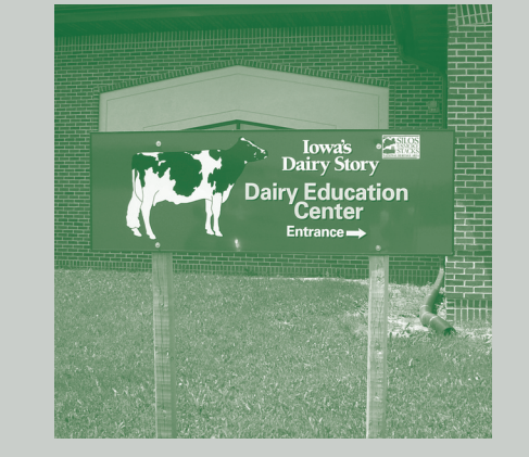
Outdoor signage funded through a SSNHA grant.

cost, low capital style of milk production, making it easier for new dairy operations to start. The Dairy Center received a SSNHA grant in 2002 to fund