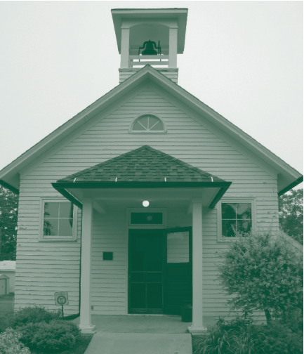
Dysart Historical Society's Country School.

Since beginning the new Partner Site designation process in January 2010, SSNHA has formally designated 11 new Emerging Sites, with a number of sites currently in the process of becoming Emerging Sites. As part of a mutual agreement, an Emerging Site must sign a Memorandum of Understanding to work directly with SSNHA staff to further develop their agricultural stories. Once each site has effectively interpreted their story through exhibits, tours, brochures or programming, they become eligible for designation as an official SSNHA Partner Site.