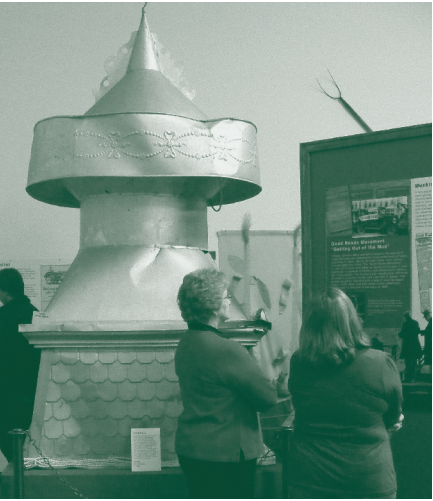
Visitors check out the new exhibit, "A Home on the Farm: Changes in Farm Life in the Mid-20th Century."

Recent examples of funded General Grant projects include the Johnson County Historical