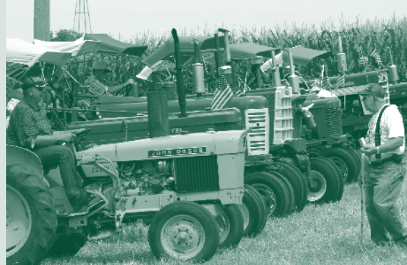
Tractor enthusiasts view vintage tractors during the annual tractor ride (Above). Students visit Froelich and participate in ropemaking demonstration (Left).

Designated as a SSNHA Partner Site in 2002, Froelich General Store and Tractor Museum lets visitors discover the story behind the tractor's invention and 1800s rural culture. In the museum's restored 1890 blacksmith shop, find a working replica of the