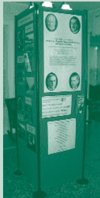
One of five displays featuring the four Iowans who served as U.S. Secretary of Agriculture.

For more information about the Wallace House Foundation or the traveling displays, you can call 515-243-7063 or visit www.wallace.org .