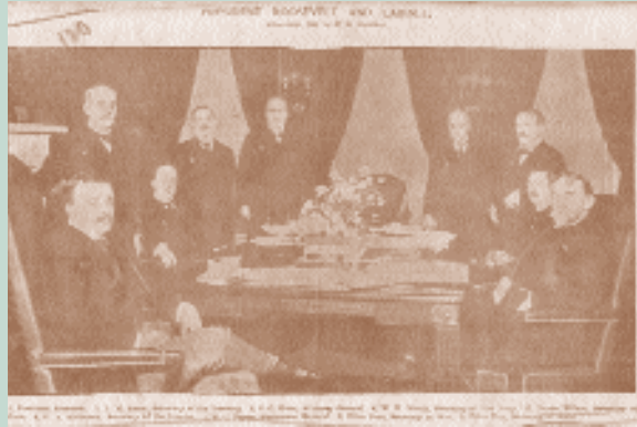
Former President Roosevelt and his cabinet, including Iowa native James Wilson who served as U.S. Secretary of Agriculture 1897-1913.

In 2002, Silos & Smokestacks National Heritage Area awarded the Wallace House