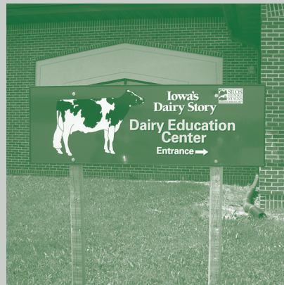
Outdoor signage funded through a SSNHA grant.

The Dairy Center received a SSNHA grant in 2002 to fund