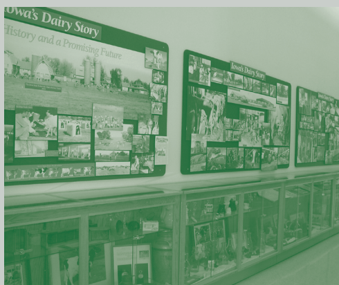
Artifacts show changes in the dairy industry.

The Dairy Center was the first in a succession of projects and facilities created by the partnership of the Dairy Foundation, ISU Extension and NICC. The calf facility, added in 2004, features a state-of-the-art building focused on calf health and operator comfort. The Grazing Center, the newest facility, demonstrates a low