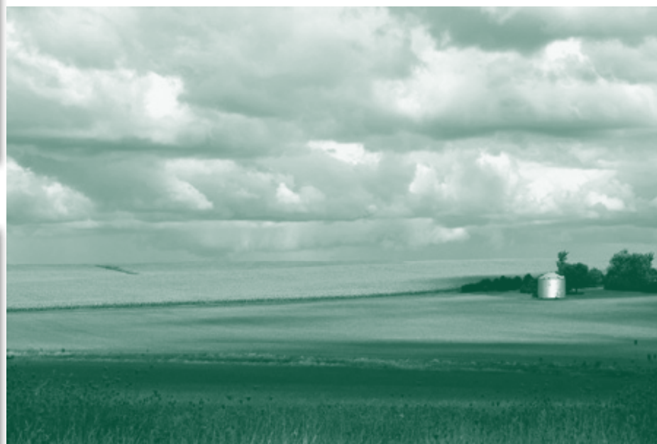
Best of Show Farmscapes, “Fall Fields,” Josh Goodell, Waterloo, IA