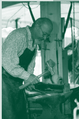
Blacksmith during 2009 rendezvous.

While Saturday and Sunday are open the public, the Friday before the event is reserved for