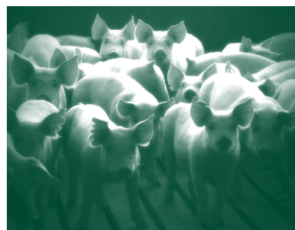
Best of Show • All Ears Traci Webb • Ankeny, Iowa