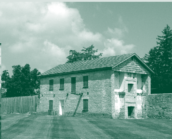
The reconstructed barracks and stokade wall now provide a visitor center and museum.

students. Known as "school day," the event lets youth experience a preview of the weekend's events. During the 2009 "school day," more than 1,260 Iowa students attended, with nearly 300 funded in part by SSNHA Bus Grant Program. For 2010, Silos & Smokestacks will be helping students from five schools attend the rendezvous.