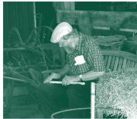
Teachers learn how to make and use their own atlatl at Hawkeye Buffalo Ranch in Fredericksburg. (Left & Above)

Some highlights from the day included making ice-cream, tasting Iowa grown foods and spear-throwing with an atlatl. Thanks to all the teachers that participated in this day-long workshop, along with the volunteers and staff at each site that helped make the day a success.