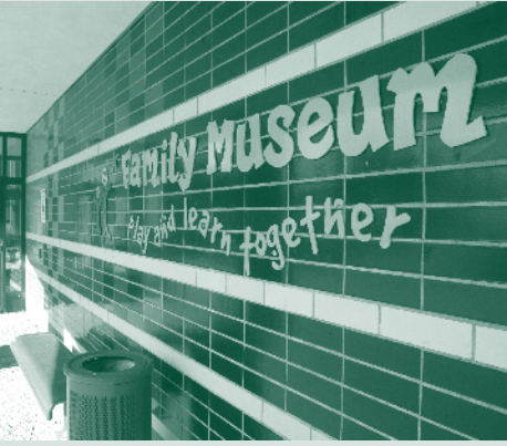
Entrance to the Family Museum, located in Bettendorf.

To help expand on the local connection of "Amazing Acres," the museum recently hired two summer interns, funded in part by a grant from Silos & Smokestacks. During their work with the museum, the interns researched the lost onion farming industry