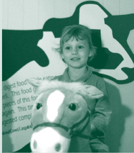
A young museum guest explores "Amazing Acres."

food production to the consumer. From "driving" a John Deere combine through the cornfields at harvest time to pumping bio-fuel at the gas station, children discover how agriculture affects us all in a fun and entertaining way.